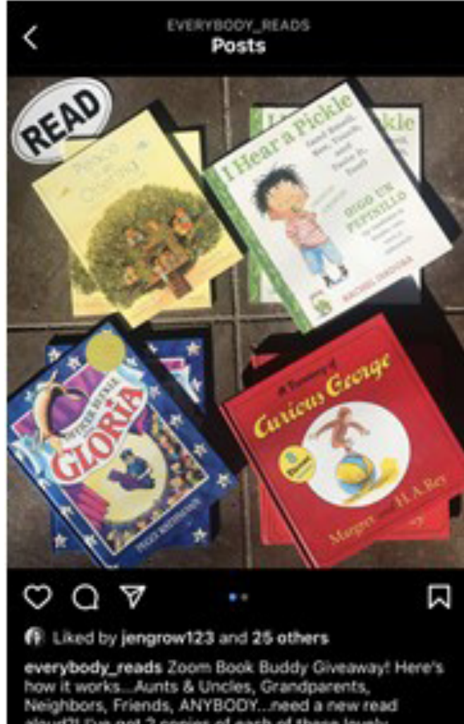
Figure 5 ZOOM BOOK BUDDIES SOCIAL MEDIA

Neighbors, Friends, ANYBODY...need a new read aloud?! Eve got 2 copies of each of these lovely books...one for you and one for your zoom book buddy! First come, First served...just message me which book & address info for where the two copies should be sent & I'll get them in the mail this weekend so you can be sharing a good book over zoom with your buddy next week!