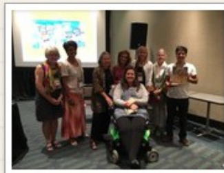
Members of the Notable Books for a Global Society committee with author/illustrator Duncan