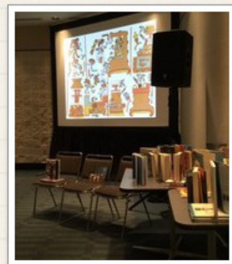
The Notable Books for a Global Society session at the 2017 ILA conference.